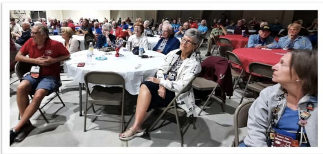
Some Penn Coachmen enjoying the evening entertainment!