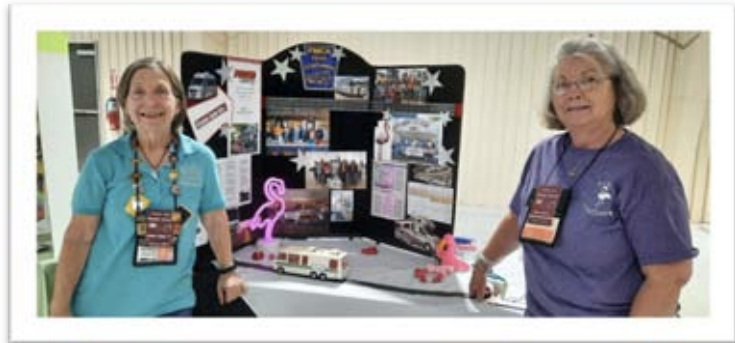
Chapter Fair...Penn Coachmen won 3rd Place!