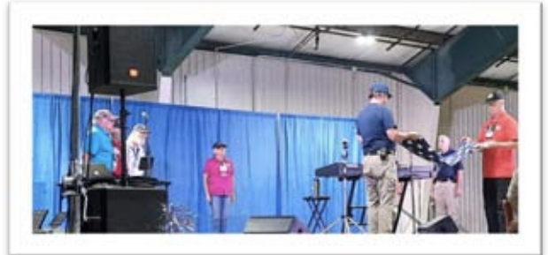
Flag folding ceremony...

Closing Ceremony... tribute to the military. The men and women who served all stood as their branch of the service was recognized.