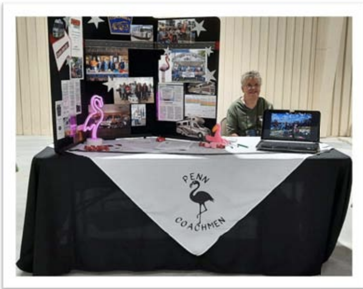
Penn Coachmen's Chapter Fair Table.