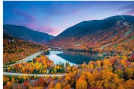
White Mountains—New Hampshire

As always, have safe travels. See you soon.