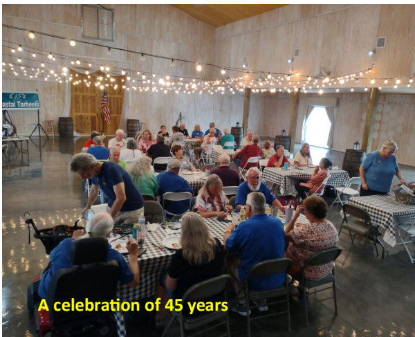
A celebration of 45 years

Some of the ladies took advantage of the local shops for some "retail therapy."