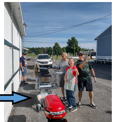
Cooking the burgers and dogs @ the Grange

Memorial Day weekend we were with our home chapter, the Penn Coachmen at the Centre County Grange Fairground.