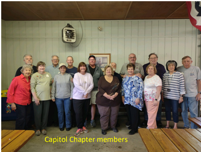
Capitol Chapter members