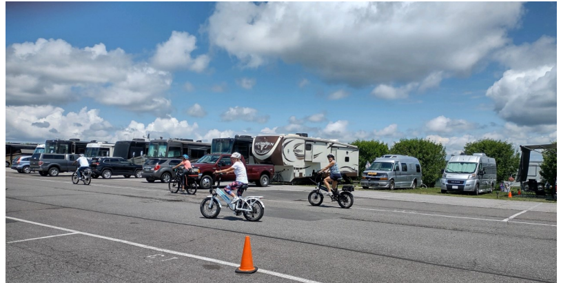
Let's take a ride around the racetrack