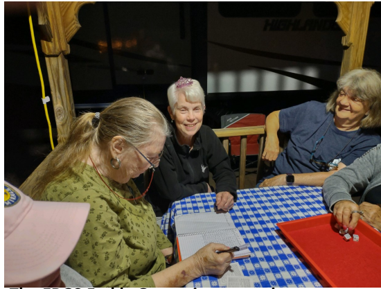
The ERGS Farkle Queen is crowned