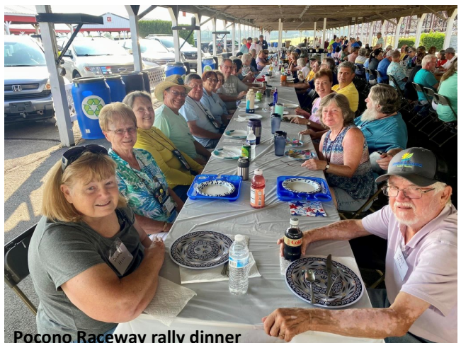
Pocono Raceway rally dinner

July. The Pocono Raceway was the site for the Penn Coachmen Open Rally July 5-7 with most attendees arriving by 7/2. This was the 3rd annual Penn Coachmen/Pocono Rally. There were 65 RVs attending. There were seminars, Nascar Ride-A-Longs, biking on the racetrack, tours of the racetrack, opportunities to explore the area plus, yes, lots of food!