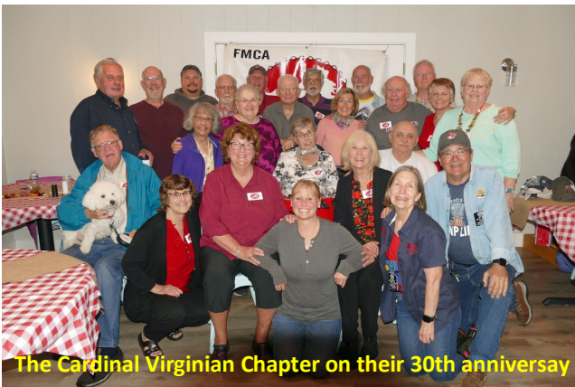
The Cardinal Virginian Chapter on their 30th anniversary