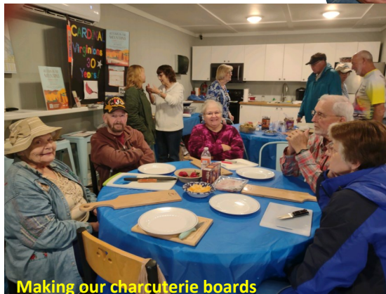
Making our charcuterie boards

July. The Pocono Raceway was the site for the Penn Coachmen Open Rally July 5-7 with most attendees arriving by 7/2. This was the 3rd annual Penn Coachmen/Pocono Rally. There were 65 RVs attending. There were seminars, Nascar Ride-A-Longs, biking on the racetrack, tours of the racetrack, opportunities to explore the area plus, yes, lots of food!