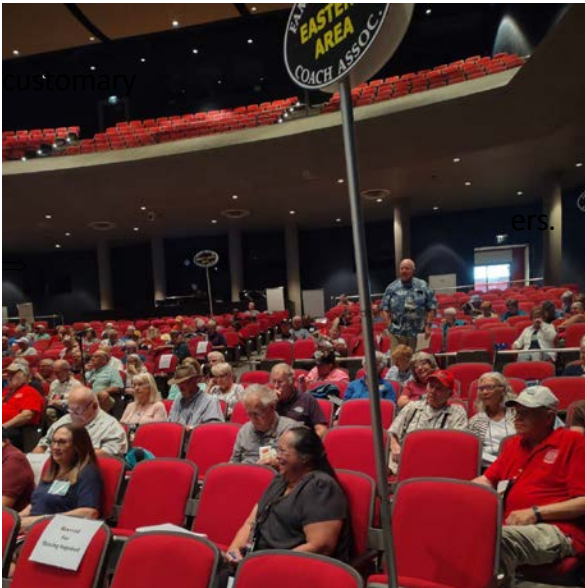
At the Eastern Area Gathering we recognized and celebrated our newest Eastern Area chapter, The Cumberland Travelers!

purposes of public identity, promotion, and normal operations. The membership also will vote changes to the Mission and Purpose of FMCA. A Bylaws change was approved to add a new category of membership called Pathfinder for prospective RV owners.