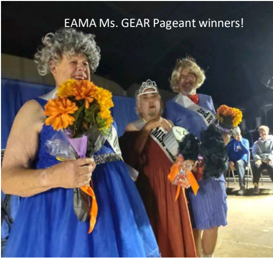
EAMA Ms. GEAR Pageant winners!