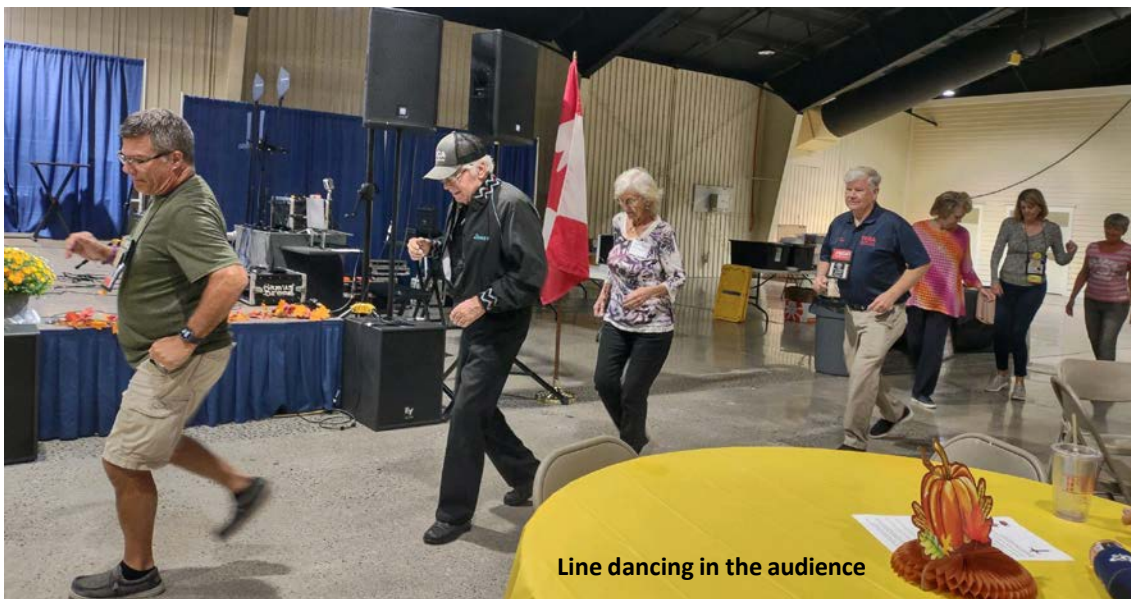
Line dancing in the audience