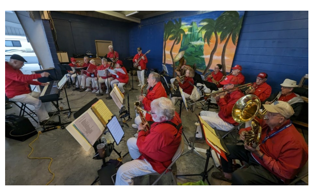
On Stage at SEA