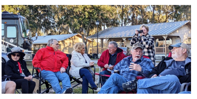
It must be 5 O'clock somewhere