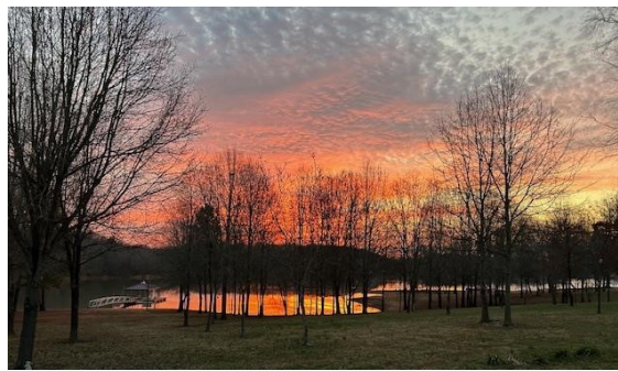
February sunrise on Butcher Creek at Buggs Island Lake